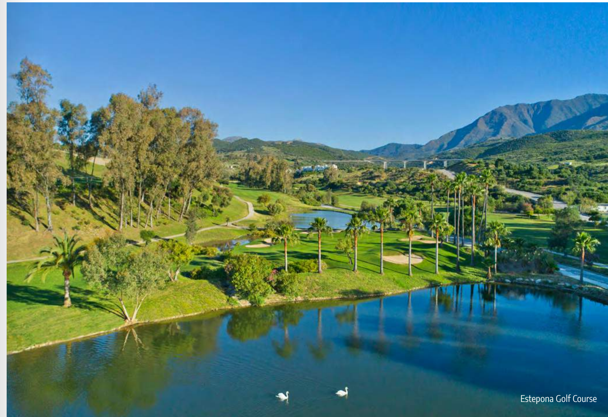
Estepona Golf Course

YOUR NEW GOLFING HOME ON THE COSTA DEL SOL