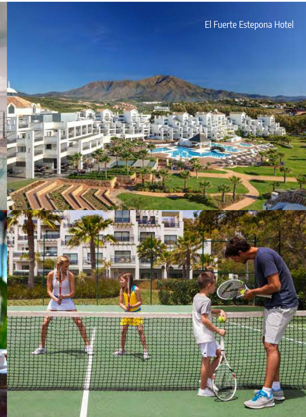
El Fuerte Estepona Hotel